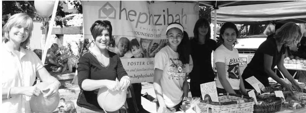
The Oak Park Auxiliary raised over $850 for Hephzibah at the Farmer's Market.

THE OAK PARK AUXILIARY BOARD OF HEPHZIBAH hosted a delicious and sweet bake sale during the September 10th Oak Park Farmer's Market. Homemade treats made by Auxiliary members, Hephzibah staff and the Berwyn/Cicero Emblem Club included a delectable selection of cakes, cookies, brownies and pies. A great selection of sugar-free, gluten-free and nut-free items were also available to the crowd. ♥