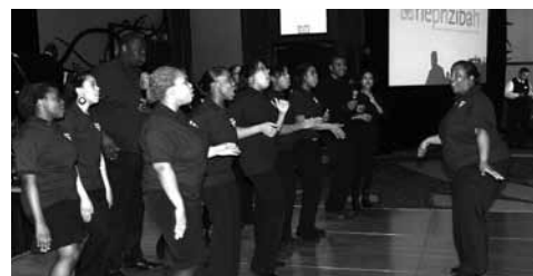
The Oak Park-River Forest High School Gospel Choir