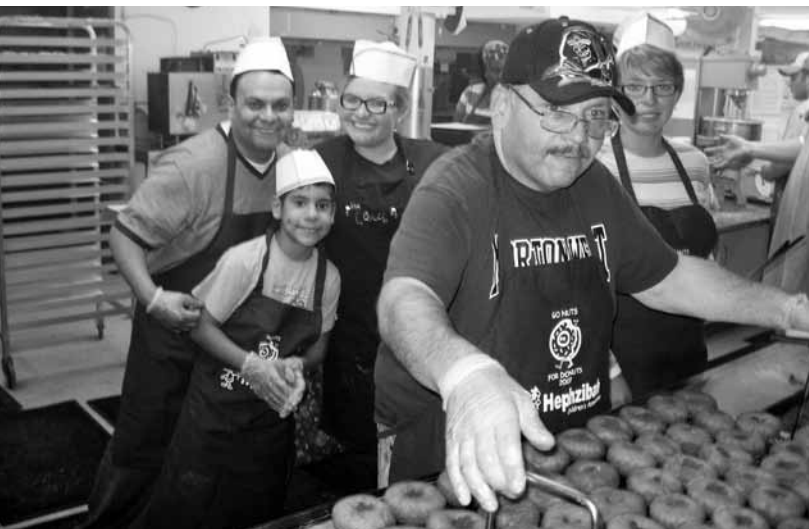
Hephzibah volunteers at the Oak Park Farmer's Market Donut Day, September 2010

HEPHZIBAH CHILDREN'S ASSOCIATION THANKS all of the incredible individuals who donate their time and energy to serving our children. We are fortunate to have numerous individuals and groups that are dedicated to our mission to enhance the lives of children and families. Volunteers are critical to our success in providing safety and care to over 1,100 and families each year.