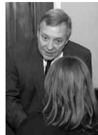
U.S. Senator Dick Durbin met with Hephzibah's Group Home children during their recent visit to Washington, D.C.

The children were awestruck by the sights and sounds of Washington. But the feelings were mutual: as they met movers and shakers, and visited the highlights of our nation's capitol, they charmed even the most cynical Washingtonians.