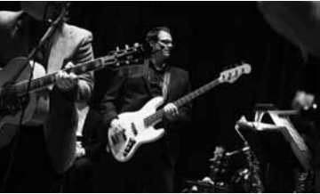
The band Tributosaurus kept the guests on their toes!

Thank you to all of our generous donors and bidders for making the Silent Auction a phenomenal success! Not only did the proceeds from the Live Auction exceed our goals, but so did the fun and excitement! We are grateful to the more than 400 Hephzibah friends and supporters who participated in the 2011 Heart of Gold Ball! You helped us raise over $250,000 for our critical programs that serve children and families.