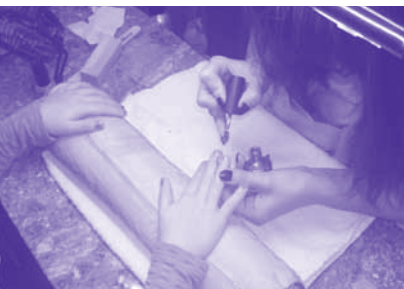
Exotic and artful designs delighted the children who participated in the face painting activity!