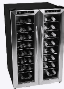
Silent Auction item: EdgeStar 32 bottle wine cooler with 50 bottles of quality wine.

You have to attend the Gala if you want to place a bid on this EdgeStar 32 bottle Dual Zone Wine Cooler with Stainless Steel Trimmed French Doors... and the 50 bottles of quality wine that come with it! Of course, this is just one of the hundreds of fabulous goodies that will be offered...from gifts for sports fans, to jewelry, to luxury get-aways and more!