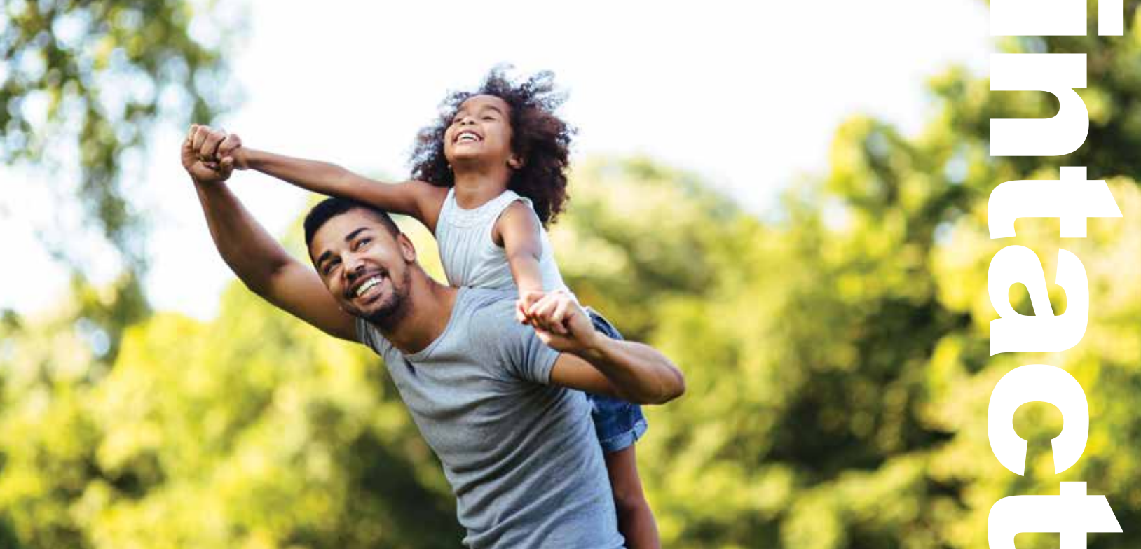
During the pandemic, Hephzibah's Intact Family Services program provided intervention and prevention services to help and heal 191 families in crisis.

the program was launched with a caseload of 10 families. Last year, we served more intact families than ever before: a total of 191 families and 457 children over a 12-month period.