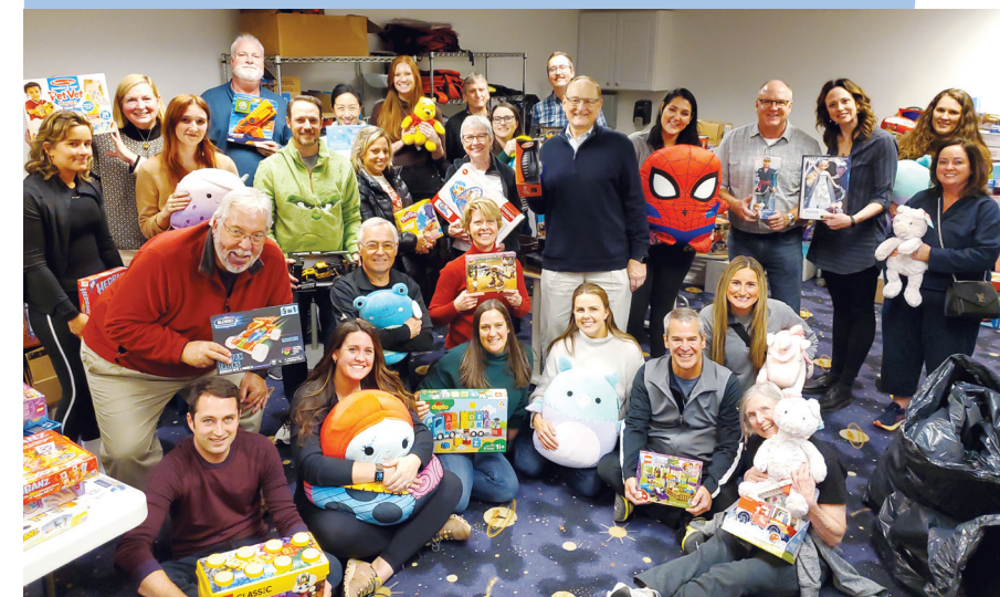
Santa's helpers from Strategex