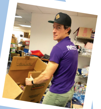
Northwestern Medicine volunteers transformed chaos into Christmas