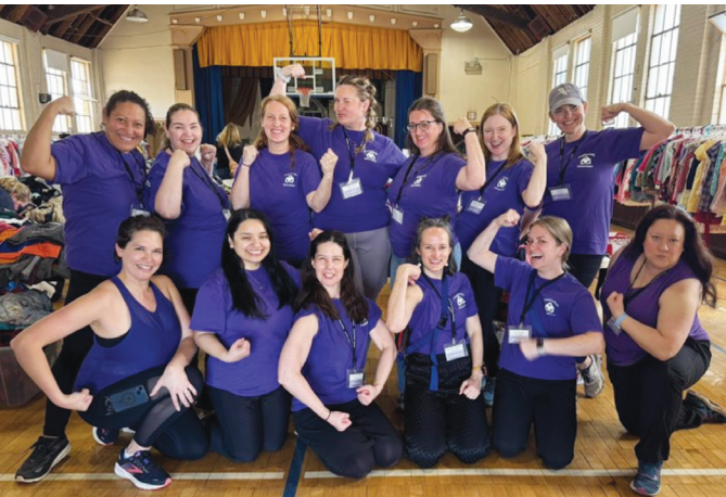
The mighty moms behind our Spring 2025 Kids Resale Event