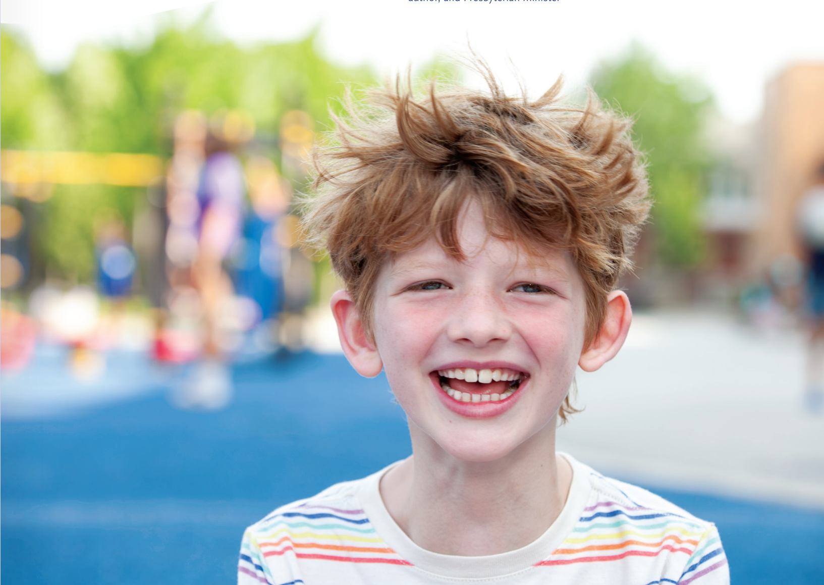
Most of the children pictured in this report are stock images or children enrolled in Hephzibah's Day Care Program whose parents/guardians have given permission to use their images. To ensure the safety and protect the privacy of the children living at Hephzibah Home or in foster homes, we have not featured any photos showing their faces.

— Fred Rogers Host of the preschool television series, Mister Rogers' Neighborhood , author, and Presbyterian minister