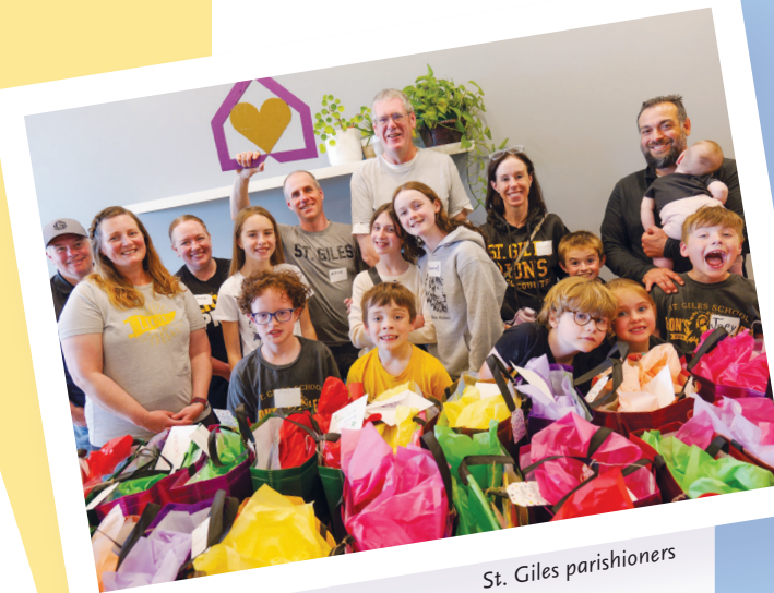
St. Giles parishioners