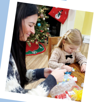
Holiday stocking stuffers

♥️ Strategex donated $10,000 to cover the cost of a holiday party and gifts for 400 children served by our Family Based Services Program. ❤️